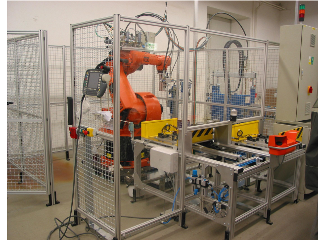
General view on the workplace