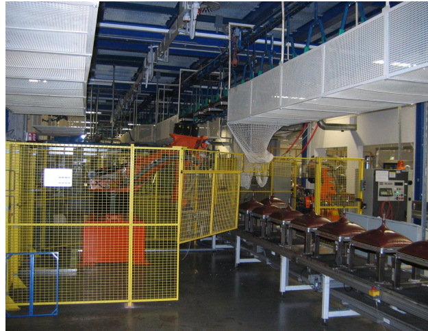
General view on conveyors