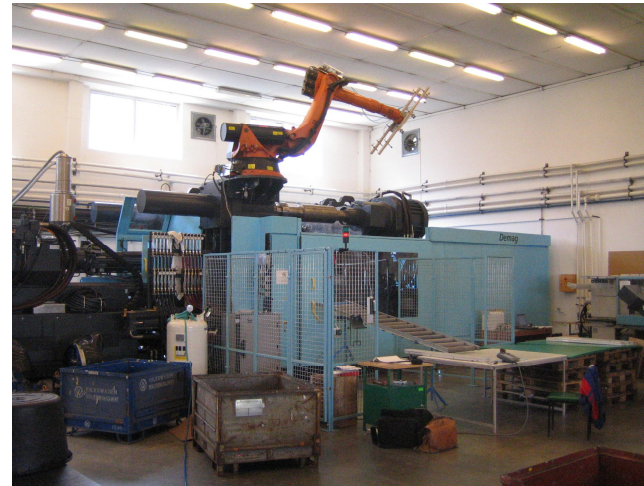
General view on the workplace