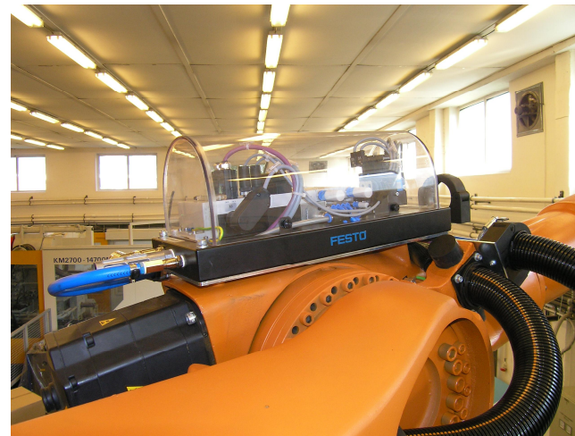
Valve battery FESTO