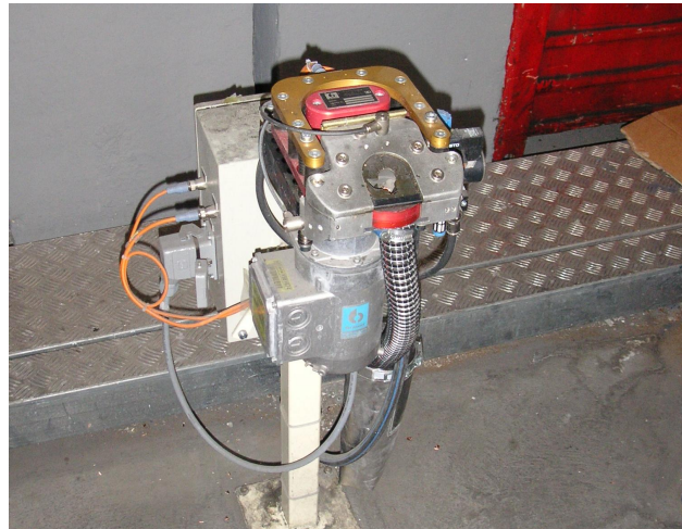
Milling cutter of caps