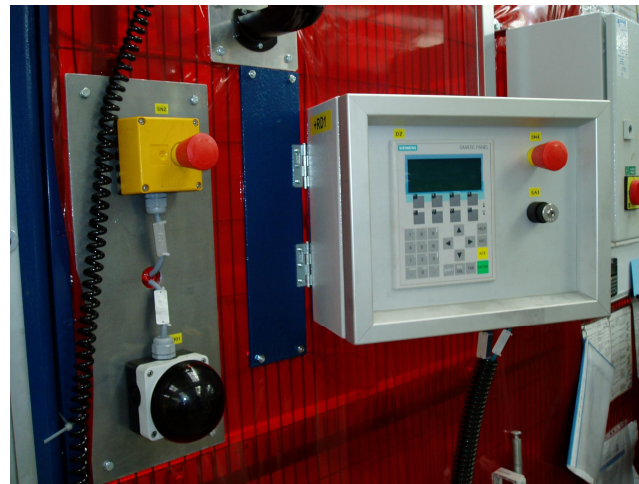
Control box with operating panel OP77