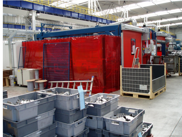
General view on the workplace